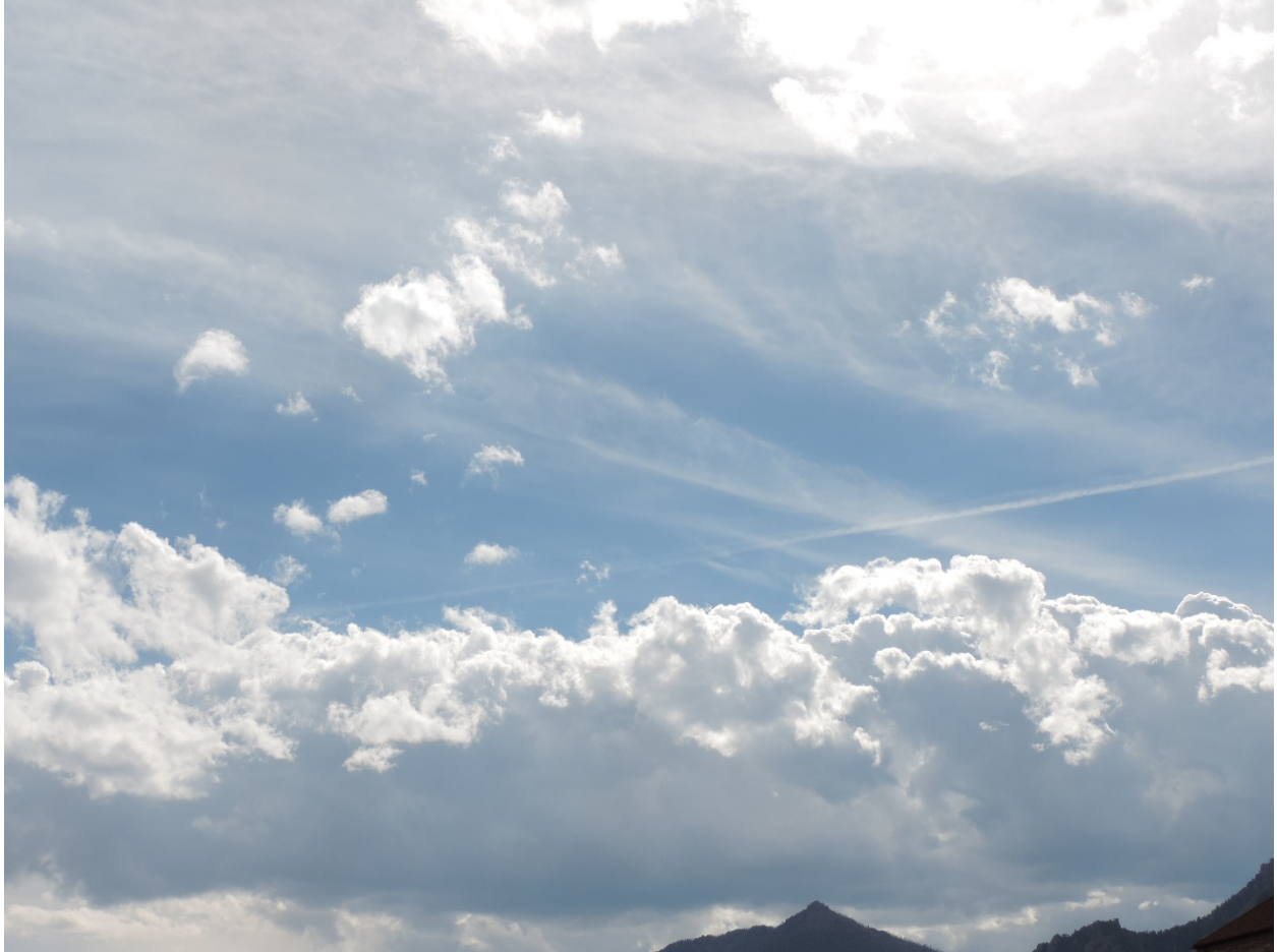
Figure 3: Raw, Unedited Image

Once the image was uploaded to a computer it was post-processed in GIMP. First the image was cropped on the top and bottom, resulting in new dimensions of 4896 pixels in width and 1992 pixels in height. This was done to highlight the cloud that I was attempting to capture. Next the color tool Curves was used to black out the foreground and increase contrast in the image. Curves was also used to bring out the intensity of the blues in the image.