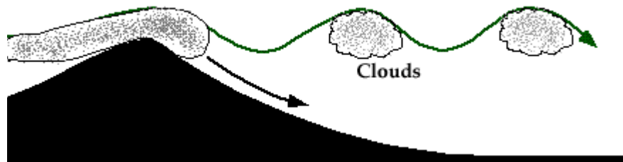
Figure 1: Graphical Representation of an Orographic Cloud Forming

The large cloud in the center of the image is cumulostratus cloud and is the subject of the image. Given that the rest of the sky was fairly clear and stable, this cloud was probably an orographic cloud caused by the change in elevation in the Front Range. As the air is forced upwards an unstable region is created and a cloud forms. As the front exits the mountain range it is heavier than the air it meets and sinks back down [2].